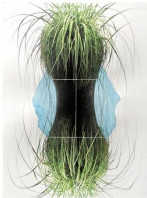
José Gomes Serie Firmitas – IVAB, 2022 Photo transfer, water color, ink and pencil on paper 76 × 56 cm