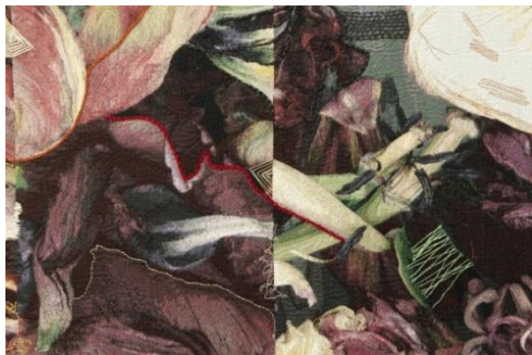
Luzia Simons Tendenz endlos (Detail), 2019–2022 Tapisserie with embroidery, polyester, cotton, wool, acryl 284 × 280 cm