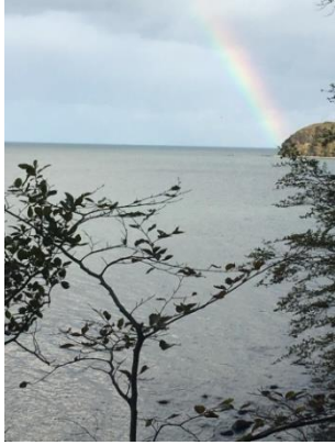
EVA & ADELE Binz, 2020 Photography 275 x 366 cm