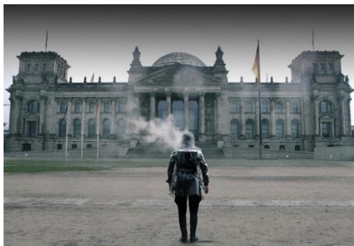
Yuan Gong Scented Air · The Stroll, 2012–2018 Videoprojection Video-Still