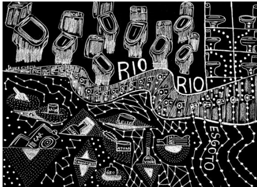
Jaider Esbell From the series It Was Amazon , 2016 Facsimile 31 × 43 cm

Galeria Jaider Esbell de Arte Indígena Contemporânea, Boa Vista, Brasilien