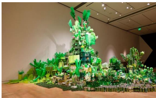
Seok Hyun Han SUPER-NATURAL , 2011 Site-specific installation made of green objects Installation view Aram Art Gallery, London

This installation will also be created for the exhibition in the Kunsthalle Rotsock.