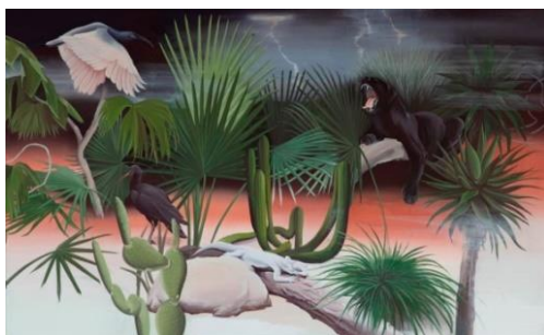
Jina Park In the Thundering Night, 2021 Egg tempera on canvas 130 × 240 cm