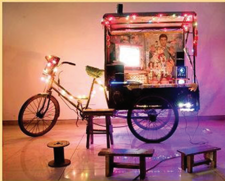
Jin Shi, Road Bicycles - Karlsruhe, 2009, mixed media installation, size variable.